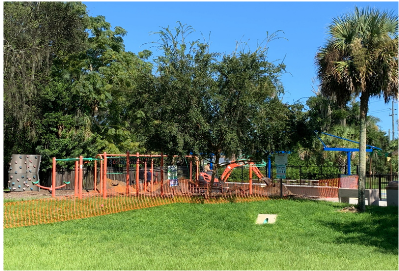
Environmental Shade Structure Now Under Construction