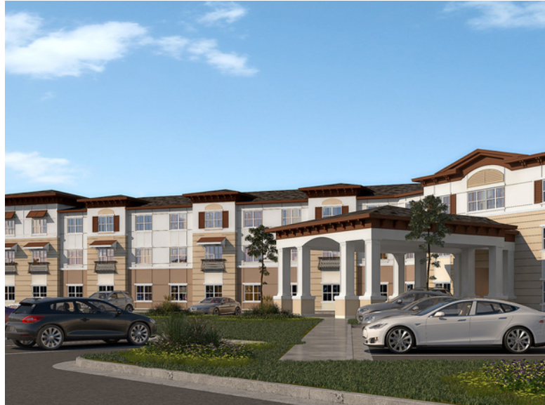
Greenlawn Manor Senior Housing Conceptual

Greenlawn Manor Senior Affordable Housing Development Progress as of September 20, 2022