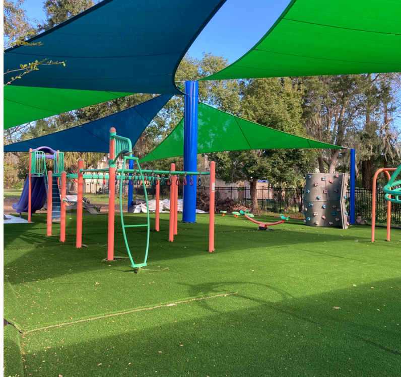
Environmental Shade Structure and Artificial Turf Now Under Construction as of 11-28-22